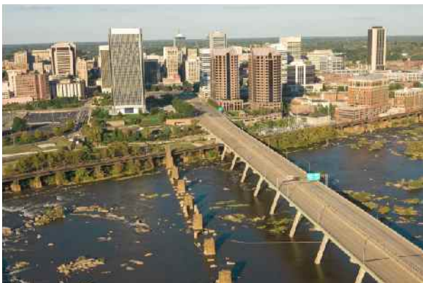
An aerial view of the city of Richmond