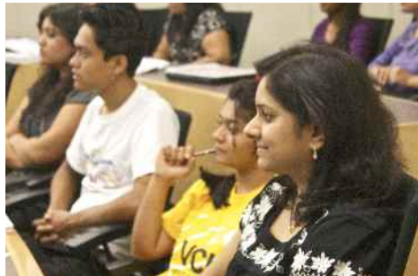
Christ University students watch a presentation in class.