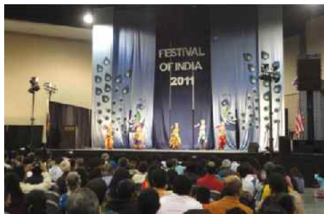
Students attend the 2011 Festival of India in Richmond, Virginia.