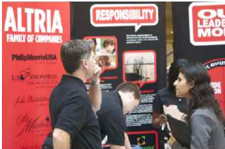
Students attend one of the many career fairs hosted by the VCU School of Business.