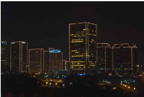
A view of the Richmond skyline at night.