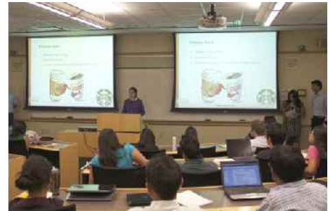
Christ University students present on an international marketing case.