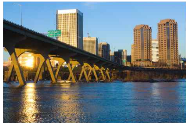
The city of Richmond overlooks the James River