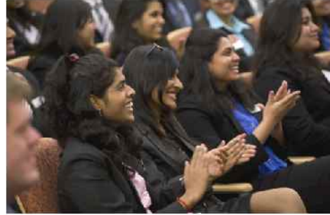
Students attend a live telecast event from Christ University with Virginia Governor, Bob McDonnell.