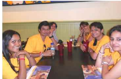
Christ University students enjoy lunch at one of VCU's many dining halls.