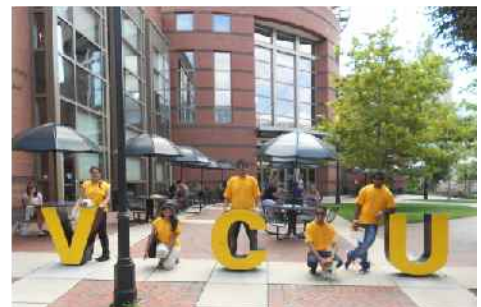
Christ University Students explore the VCU campus.