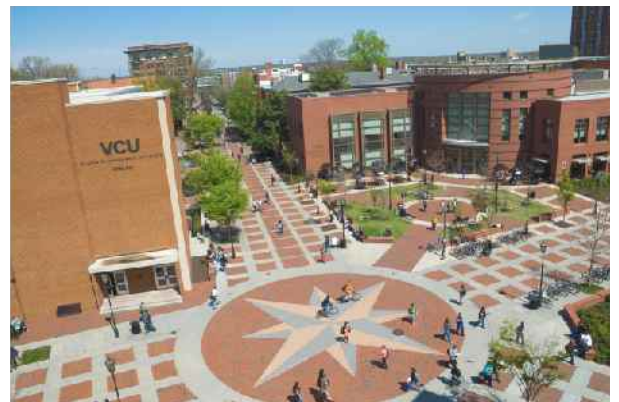
'The Compass', located on main campus of VCU