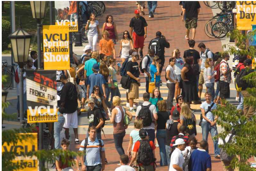
VCU students walk across campus.